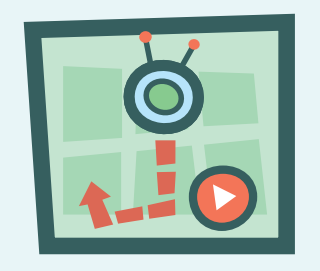
using your own device, see if the task has been performed correctly