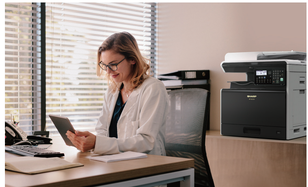
A stylish complement to any office space.

There's no complex set-up or messy cables. An optional wireless LAN lets you connect to any WiFi enabled device, so that anyone can print or scan directly from their smartphone, tablet or PC using AirPrint ™2 , Google Cloud Print or the Sharpdesk Mobile app. Or insert a USB drive and simply select a file from the pop-up menu to directly print any stored documents or save scans to it without having to use a PC.