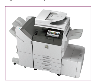
USB Office Direct Print and Print Release make for more flexible and efficient working.

There's no need to risk leaving important or sensitive information unattended. Using the Print Release feature you can send your print jobs to a main MFP and then print them off whenever you want on any connected device. Simply walk up, log on and print your documents.