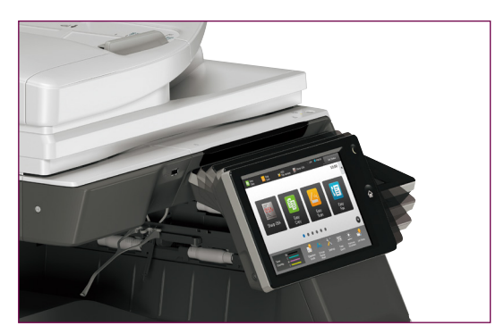
10.1" tiltable touchscreen control panel.

These MFPs are designed to help you do much more in much less time.