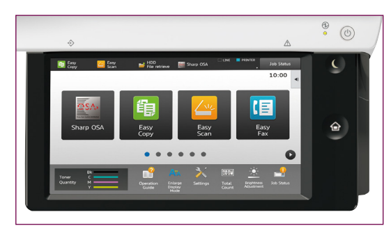
Users can customise the home screen for more efficient working.

Productivity boost with print speeds ranging from 26 to 60 pages per minute (ppm). And you can print on paper up to SRA3 size and weights of 300gsm. There are also a number of features that are designed to streamline production, including a Reversing Single Pass Feeder (RSPF) for fast digitisation of your documents. And, as no one likes interruptions, the higher speed MFPs*1 also let you top up the toner without pausing copy/print jobs which maintains productivity and reduces any downtime.