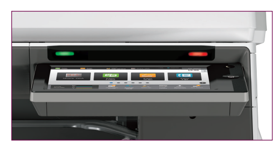
Visual feedback indicates MFP activity.

• Ongoing savings – to reduce waste and help you achieve your environmental goals the toner cartridge stays locked in place until the toner has been fully used up.