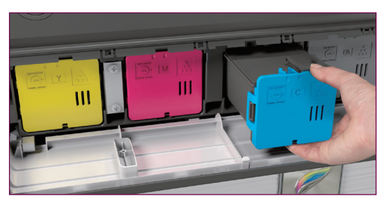
To ner\ cartridges\ automatically\ eject\ only\ when\ fully\ exhausted.

• Ongoing savings – to reduce waste and help you achieve your environmental goals the toner cartridge stays locked in place until the toner has been fully used up.