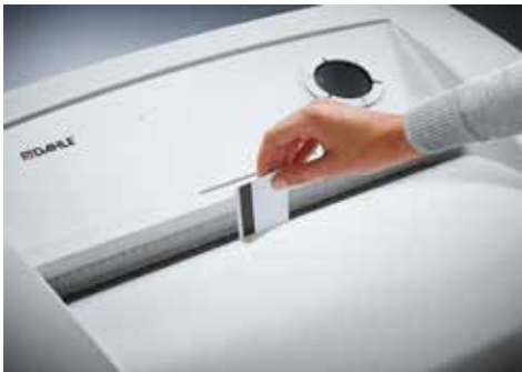
Dahle Office 416air document shredder