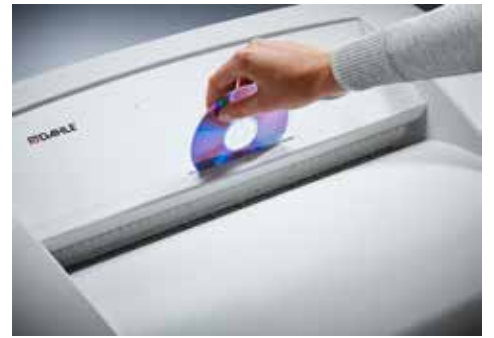
Dahle Office 416air document shredder