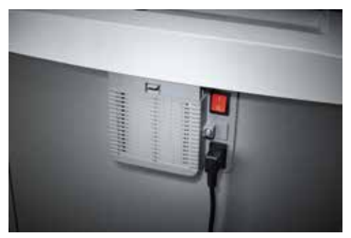
Dahle Office 416air document shredder