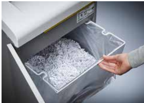
Dahle Office 416air document shredder