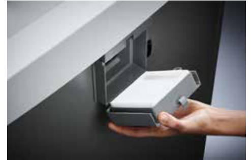
Dahle Office 416air document shredder