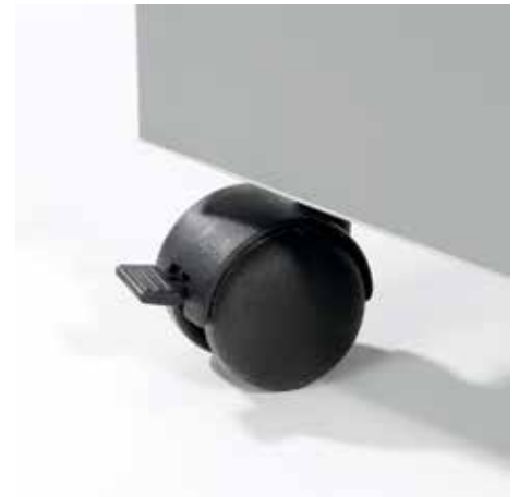
Practical swivel casters for flexible use