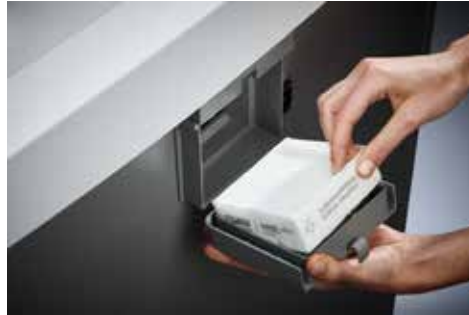
Dahle Office 416air document shredder