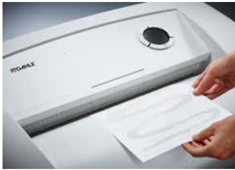
Dahle Office 416air document shredder