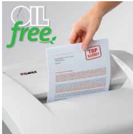
Shredding the convenient way, all without the time-consuming process of oiling the cutters