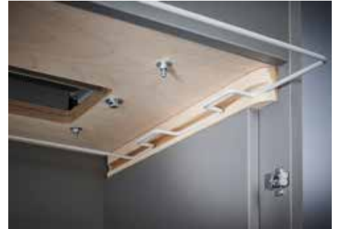
Dahle Office 416air document shredder