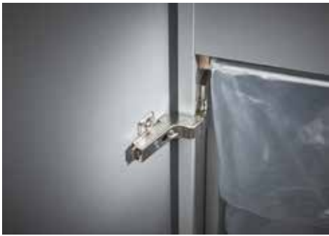
Dahle Office 416air document shredder