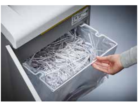
Dahle Waste 203 document shredder