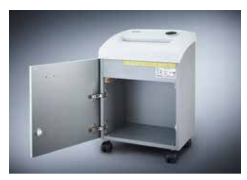
Dahle Waste 203 document shredder