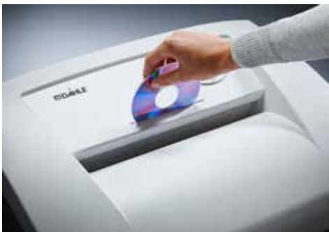
Dahle Waste 104 document shredder