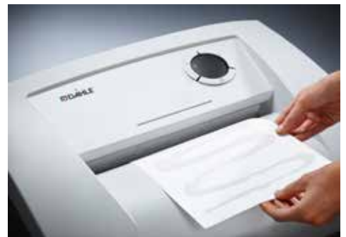
Dahle Waste 104 document shredder