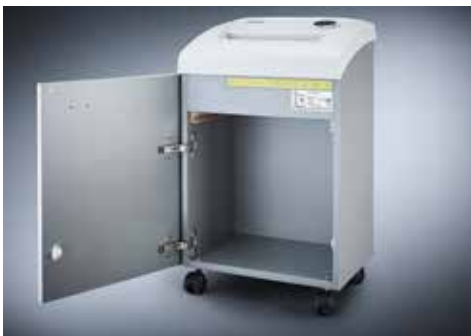
Dahle Waste 104 document shredder