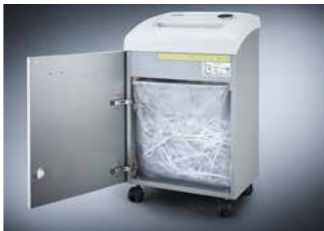
Dahle Waste 104 document shredder