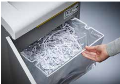
Dahle Waste 104 document shredder