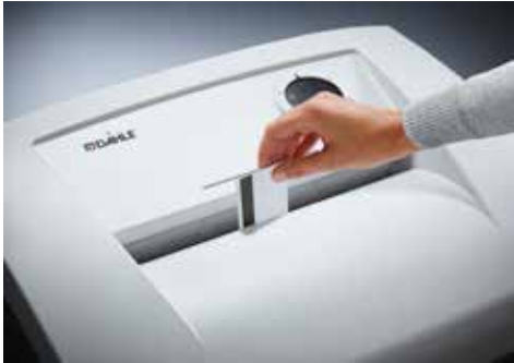
Dahle Waste 104 document shredder