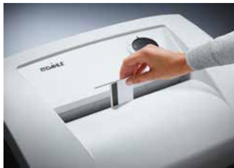
Dahle Waste 106 document shredder