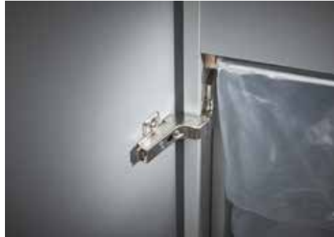
Dahle Waste 106 document shredder