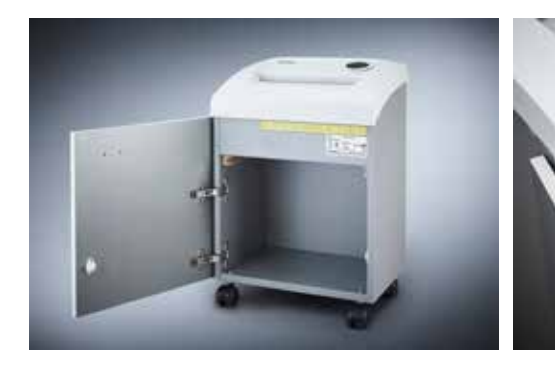
Dahle Office 403 document shredder