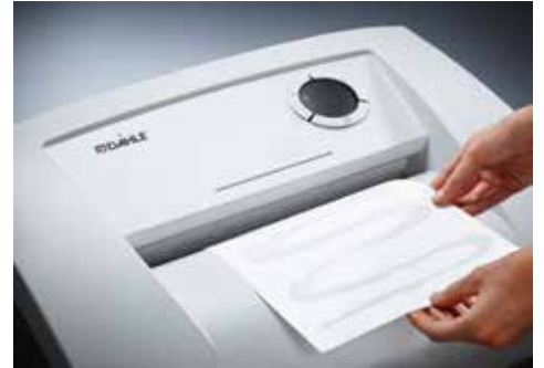
Dahle Waste 210 document shredder