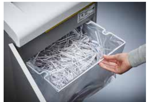
Dahle Waste 214 document shredder