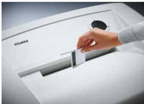
Dahle Waste 214 document shredder