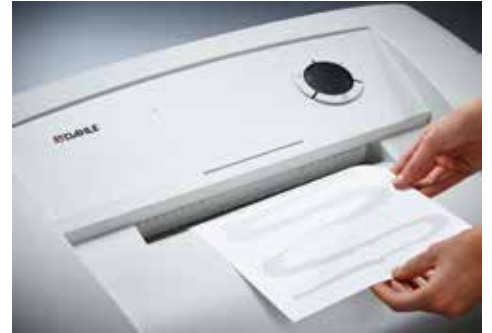
Dahle Waste 214 document shredder