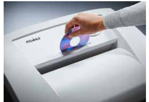
Dahle Office 406 document shredder