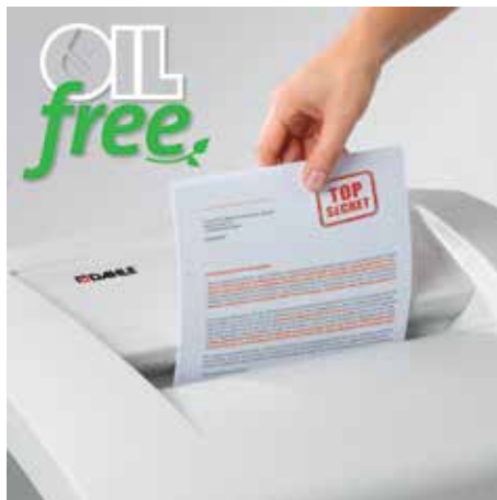
Shredding the convenient way, all without the time-consuming process of oiling the cutters