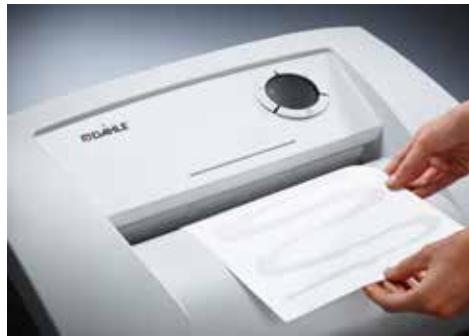
Dahle Office 406 document shredder