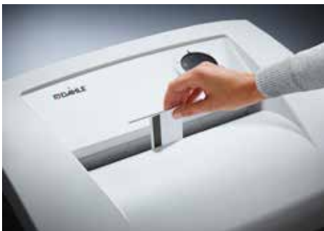
Dahle Office 406 document shredder