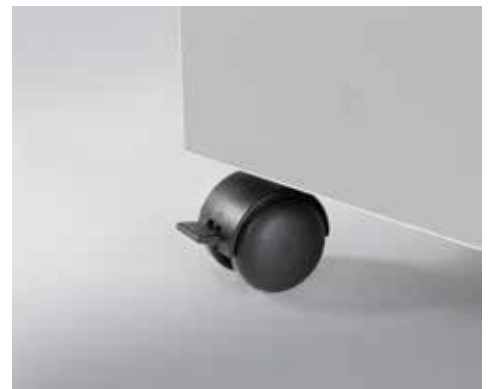
Practical swivel casters for flexible use