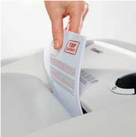
Innovative MHP technology® shreds up to 30 % more paper