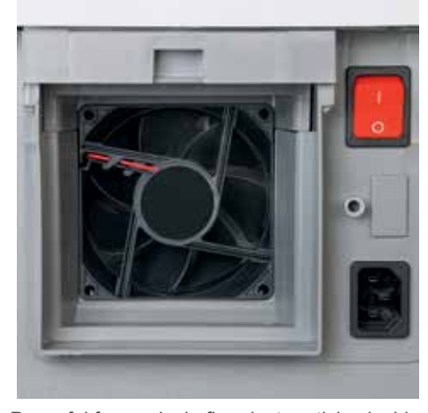
the document shredder and feeds them to the filter