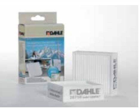
Fine particle filters Dahle 20710