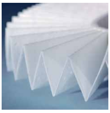
Environmentally friendly filter is made of speci- Powerful fan sucks in fine dust particles inside al 3-ply, fully recyclable non-woven material