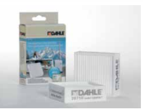
Fine particle filters Dahle 20710