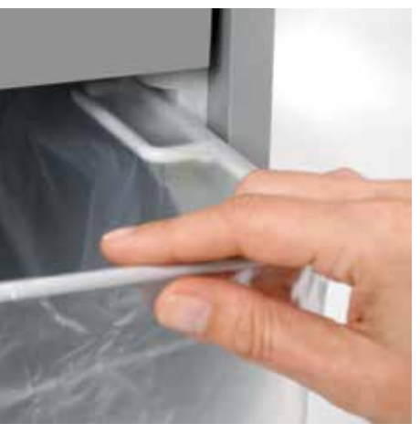
Pull-out rounded top frame that's kind on the fingers when changing the waste bag