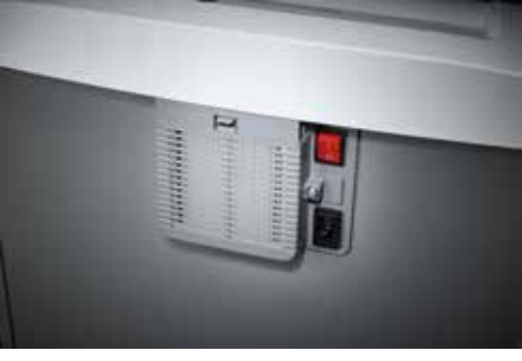
Dahle Waste 106air document shredder