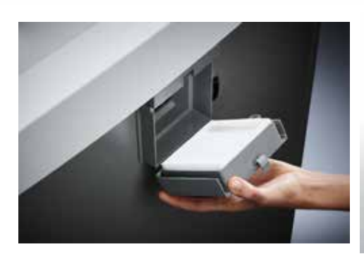
Dahle Waste 106air document shredder