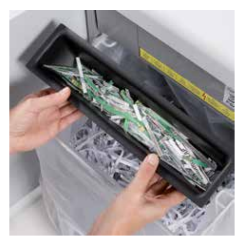
Separate, integrated waste boxes help to sort shredded paper, CDs, DVDs, cheque and credit cards for eco-friendly recycling