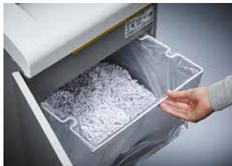
Dahle Office 414 document shredder