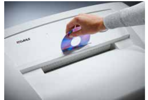
Dahle Office 414 document shredder