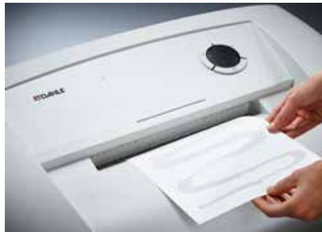
Dahle Office 414 document shredder