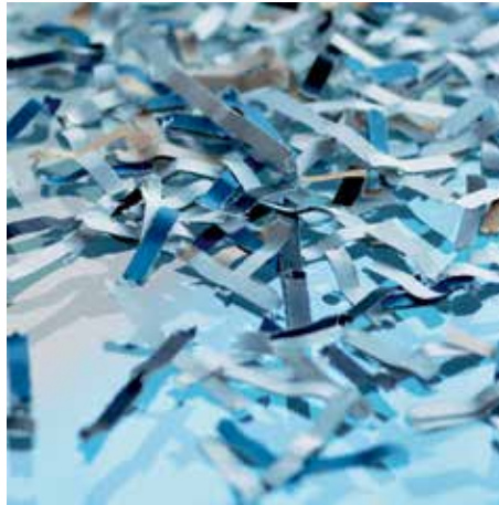
P-4 security: recommended, for example, for data media containing particularly sensitive, confidential and personal data