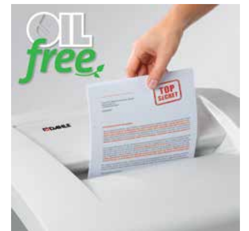
Shredding the convenient way, all without the time-consuming process of oiling the cutters