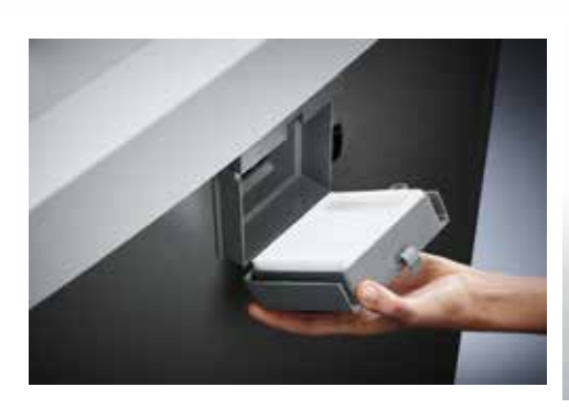
Dahle Waste 114air document shredder