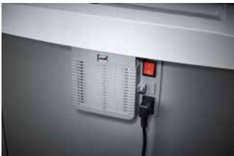
Dahle Waste 216air document shredder