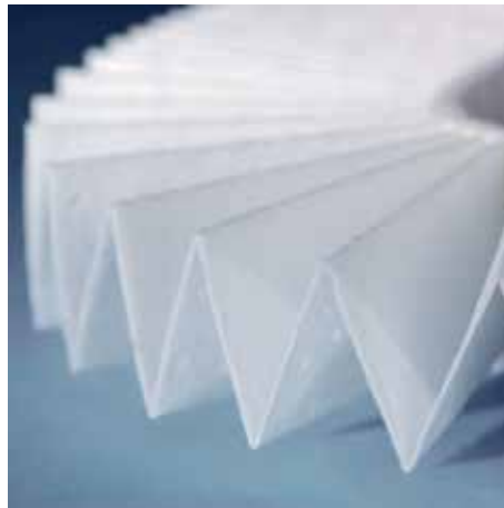
Environmentally friendly filter is made of special 3-ply, fully recyclable non-woven material