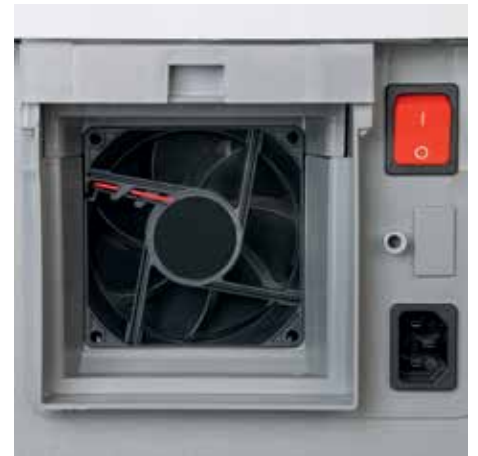
Powerful fan sucks in fine dust particles inside the document shredder and feeds them to the filter