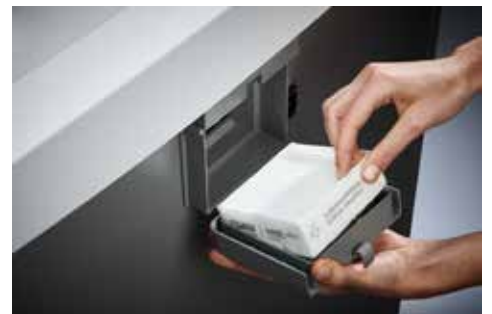
Dahle Waste 216air document shredder