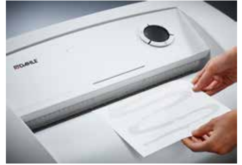
Dahle Waste 216air document shredder