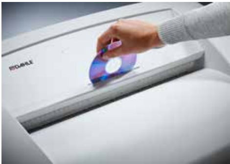
Dahle Waste 216air document shredder