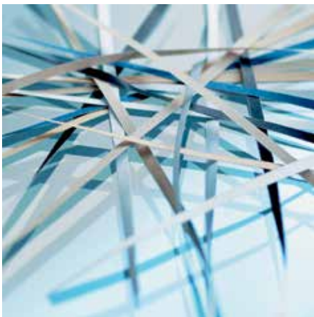
P-2 security: recommended, for example, for data media containing internal data that are to be made illegible