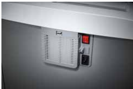
Dahle Waste 216air document shredder