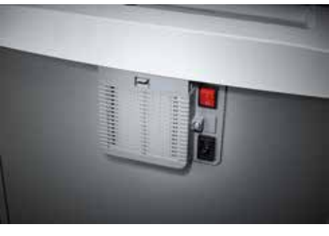
Dahle Waste 116air document shredder