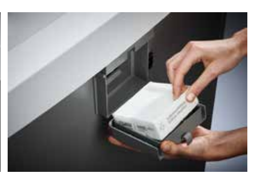
Dahle Waste 116air document shredder