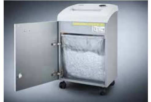
Dahle Security 504 document shredder