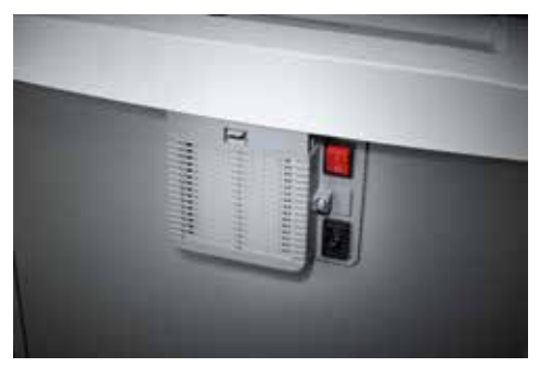
Dahle Security 504air document shredder