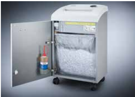
Dahle Security 504air document shredder