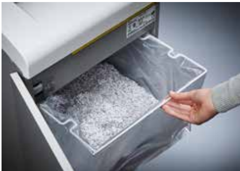
Dahle Security 504air document shredder