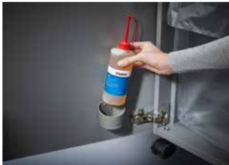
Dahle Security 504air document shredder