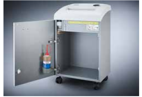
Dahle Security 504air document shredder