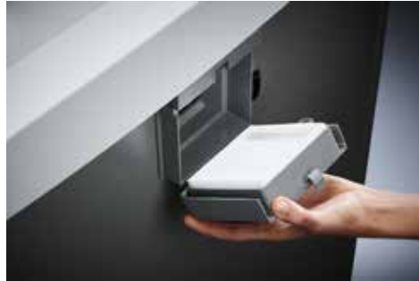
Dahle Security 504air document shredder