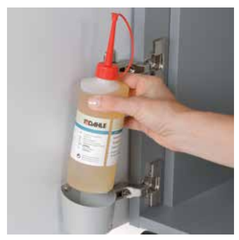
Environmentally friendly oil is always easy to access, included with all cross-cut models

Detachable IEC power plug makes the document shredder quick and easy to move from A to B