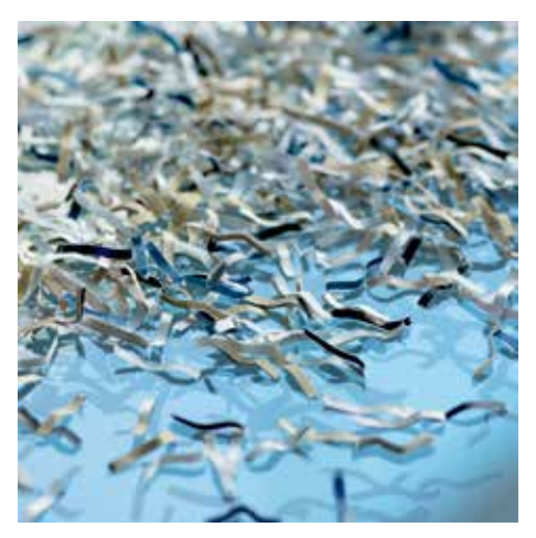
P-5 security: recommended, for example, for data media containing secret data