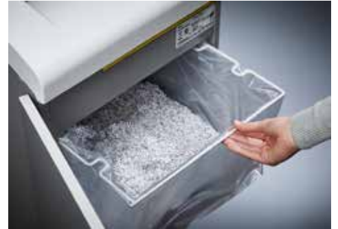
Dahle Security 510 document shredder