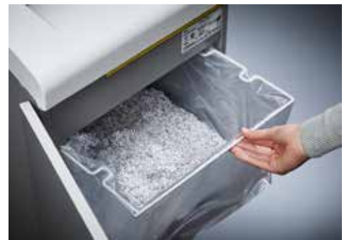
Dahle Security 514 document shredder