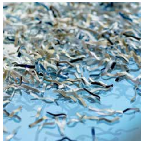
P-5 security: recommended, for example, for data media containing secret data