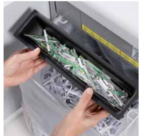
Separate, integrated waste boxes help to sort shredded paper, CDs, DVDs, cheque and credit cards for eco-friendly recycling