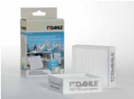
Fine particle filters Dahle 20710