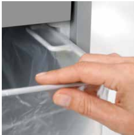
Pull-out rounded top frame that's kind on the fingers when changing the waste bag