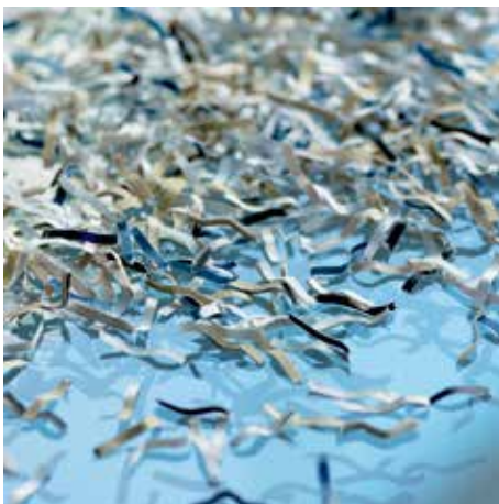
P-5 security: recommended, for example, for data media containing secret data