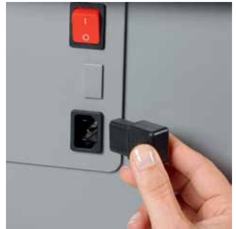
Detachable IEC power plug makes the document shredder quick and easy to move from A to B