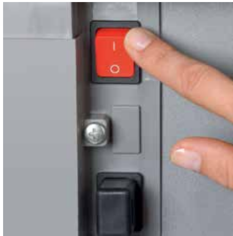
Separate main switch is located on the rear of the document shredder and completely disconnects it from the mains power supply