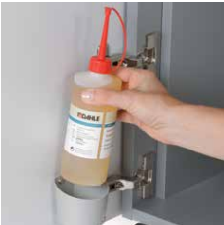
Environmentally friendly oil is always easy to access, included with all cross-cut models