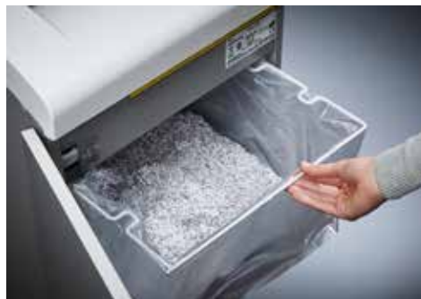
Dahle Security 516air document shredder