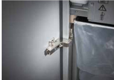
Dahle Security 516air document shredder