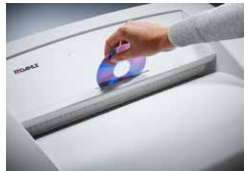
Dahle Security 516air document shredder