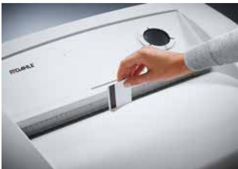
Dahle Security 516air document shredder