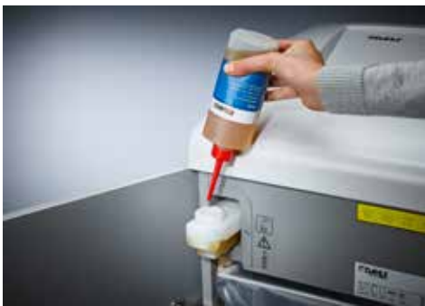
Dahle Security 516air document shredder