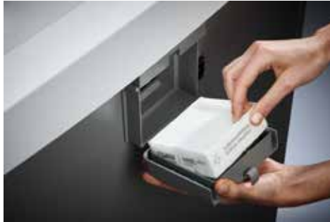
Dahle Security 516air document shredder