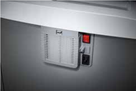
Dahle Security 516air document shredder